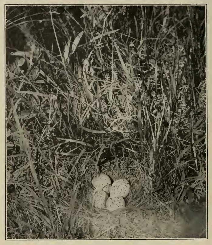
NEST AND EGGS OF UPLAND PLOVER

growth along the pond, and they may have nested in situations of that kind before the groves were present. However that may be, it was, at the time these notes were made, one of the most characteristic and abundant birds of the region.